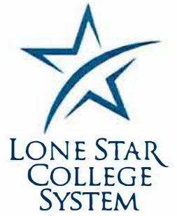
Exhibit B Vendor Information Form