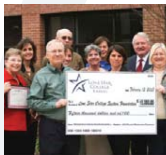
LSC-Tomball Math Department staff presenting its second $15,000 endowment to the LSC-Foundation. Recently, the Math Department funded its third endowment.

What began as a project 10 years ago to create a lab manual for algebra courses at Lone Star College-Tomball, eventually evolved into a hefty endowment benefitting student scholarships.