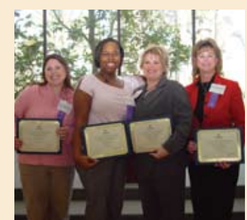
2007 Student Essay Contest winners who each received a $1,000 scholarship from the LSC Foundation. Attend the Chancellor's Breakfast on Jan. 28, 2009, and meet the 2008 winners and learn how their experiences at a Lone Star College influenced their lives.

To donate to the summer bridge scholarship program please contact the LSC Foundation office at 832.813.6637 or use the enclosed envelope.