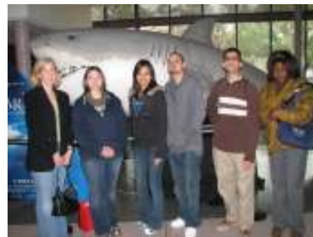
Members of HSO at the Natural Science Museum.