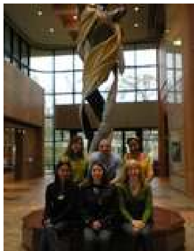
The group poses for a photo inside the newly built theater complex at Brazosport College.

Nominations for 2009-2010 HSO Officers will remain open until May 2009