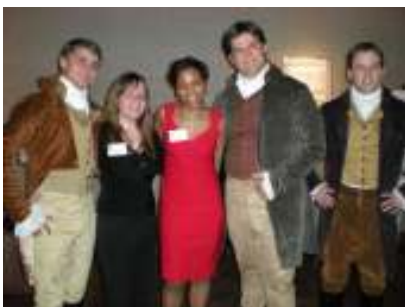
Honors students pose with members of the Arcadia cast.

Honors students and faculty from regional colleges attended the retreat in Lake Jackson, TX. Attendees stayed overnight at the Cherhotel and were treated to a planetarium show at the Center for Arts and Sciences. After a buffet dinner, students were able to see Tom Stoppard's Arcadia . Afterwards, there was a chance to talk with the cast and the director of the play.