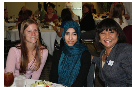
Above: Students enjoying the March 23 Scholarship Luncheon

Each year, LSC-Tomball hosts a luncheon to honor individuals, organizations and businesses whose contributions provide scholarships for students. This event provides an opportunity for donors to meet the students whose lives they have touched through their scholarships. This year's luncheon was held on March 23.