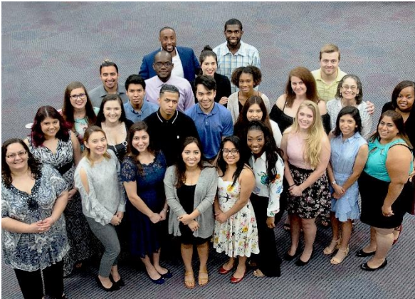
2018 LSC-Tomball TRIO SSS Graduates